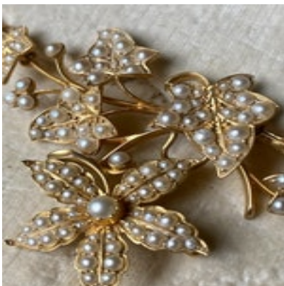
Beautiful Victorian Natural Pearl Necklace in 15ct, Ca1880 £2,950.00