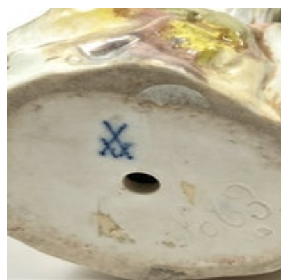
Pair of Meissen parrots POA