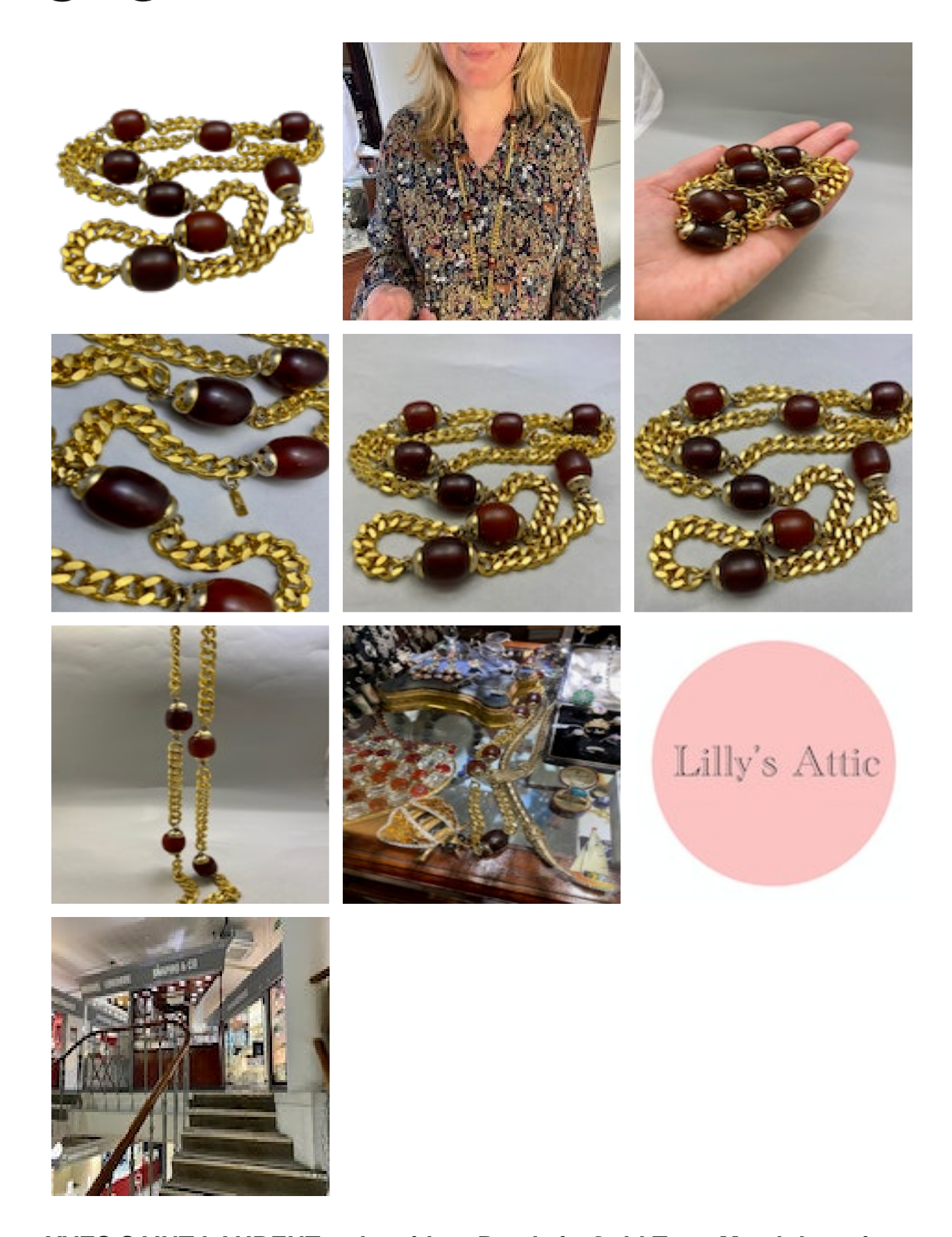
YVES SAINT LAURENT red vari-hue Beads in Gold Tone Metal date circa 1970, Lilly's Attic since 2001